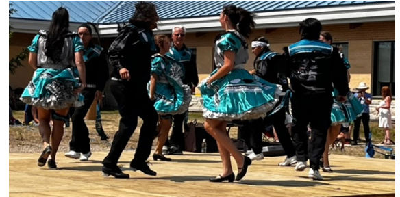
Celebrations were in full swing as onlookers enjoyed the Asham Stompers dance the Red River Jig, at National Indigenous Peoples Day in Sioux Lookout, ON.

Today June 21, we join in celebrating National Indigenous Peoples Day. This is a day for all Canadians to recognize and celebrate the unique heritage, diverse cultures and outstanding contributions of First Nations, Inuit and Métis people. It is a day for all of us to reflect and honour the Indigenous people who inhabit their traditional lands since time immemorial. Today, and every day, all of us at First Mining Gold acknowledges the beauty of the Cultures, the strength in the teachings, and the resilience of past, present and future generations.